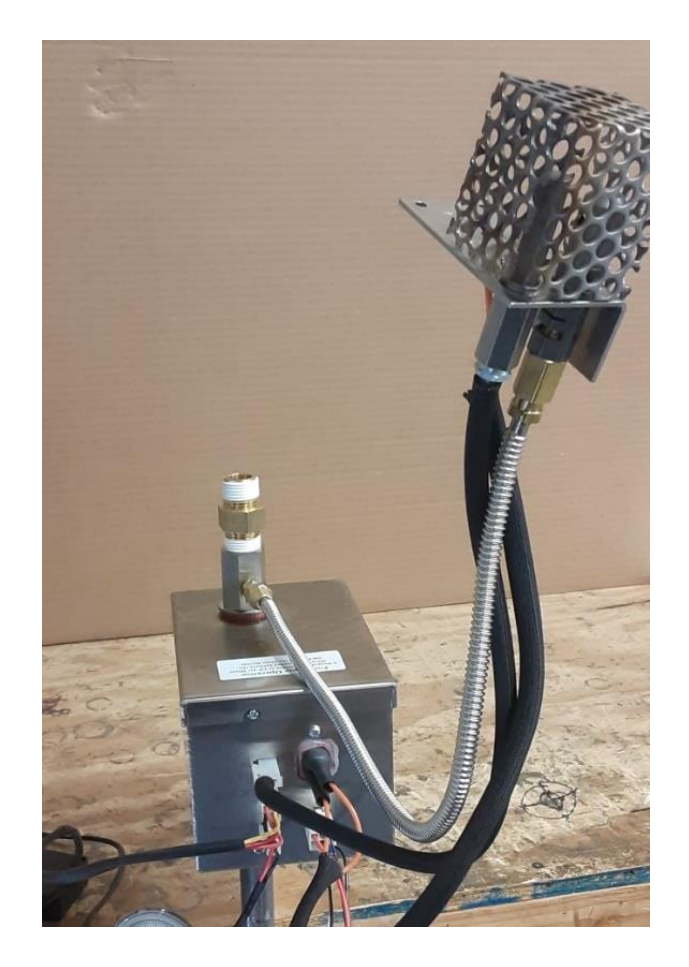
Step 6: Install the Pilot Burner Assembly as shown at right

Note: At right is a close-up view of the electrical connections for the Pilot Burner to the front of the Ignition Control Box