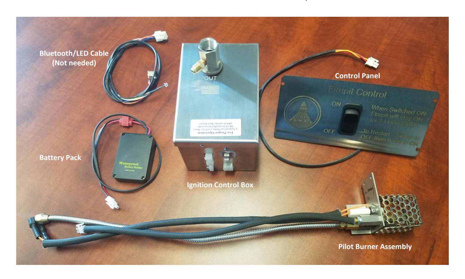
Step 1: Remove the Existing Electronic Ignition Systems

Below are the Components shipped with the Battery System Not shown are the Round Flat Burner Pan and 12" Spiral Burner