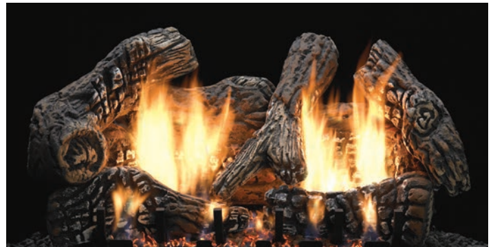
Super Charred Oak Ceramic Fiber Log Set (LS-24C2S) with Vent-Free Slope Glaze Burner System (VFSR-24)