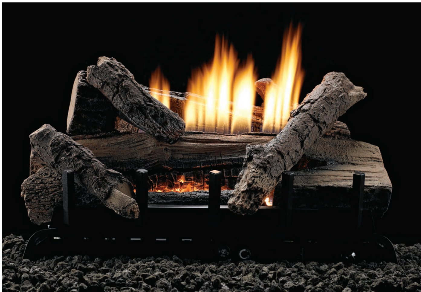
Whiskey River Refractory Log Set and Vent-Free Burner Combination (VFDR-18-LBW)

The Flint Hill and Whiskey River are also offered in 10,000 Btu models for bedroom applications, where allowed by code.