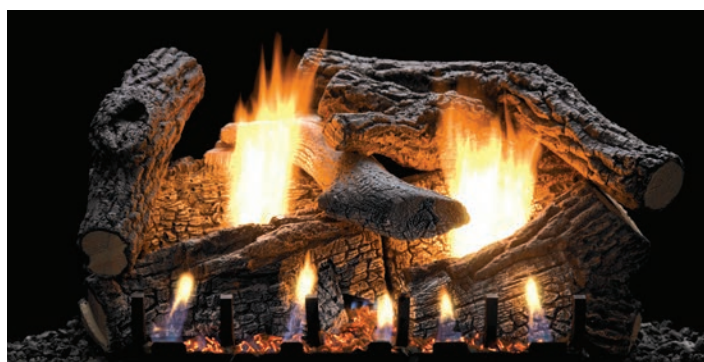
Super Sassafras Refractory Log Set (LS-24RSS) with Vent-Free Slope Glaze Burner System (VFSR-24)