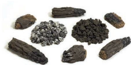
EK-1 Traditional Ember Bed Kit includes six burnt log pieces, white ash, and lava rock.