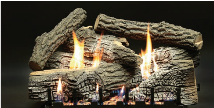
Super Stacked Wildwood Refractory Log Set (LS24WRS) with Vent-Free Slope Glaze Burner System (VFSR-24)