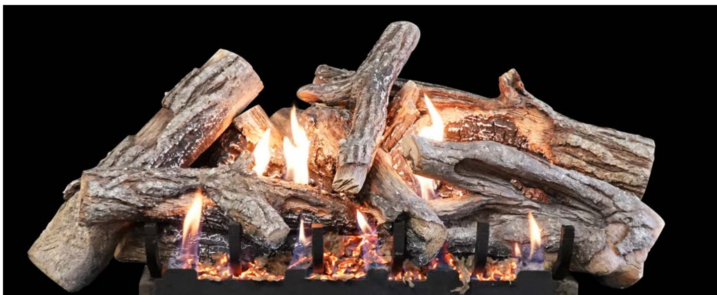
Fallen Timber Log Set (LS-24CT) with Vent-Free Slope Glaze Burner System (VFSR-24)