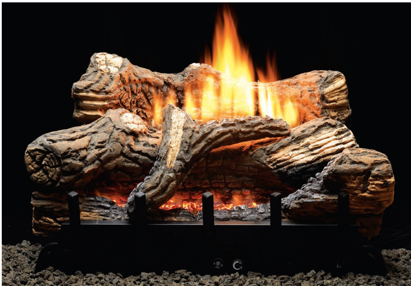
Flint Hill Ceramic Fiber Log Set and Vent-Free Burner Combination (VFDR-24-LB)

This competitively priced log/burner is ideal for existing fireplaces and fireboxes and for new construction.