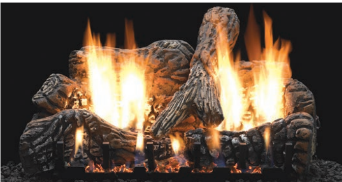
Charred Oak Ceramic Fiber Log Set (LS-24C2) with Vent-Free Slope Glaze Burner System (VFSR-24)