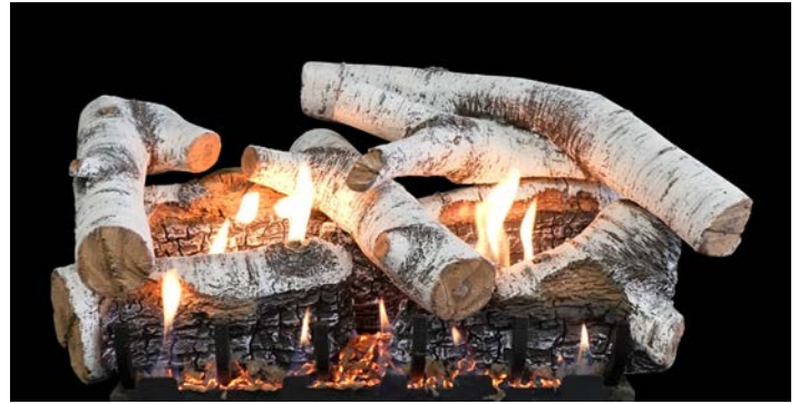
Super Birch Burncrete® Log Set (LS-24CBS) with Vent-Free Slope Glaze Burner System (VFSR-24)