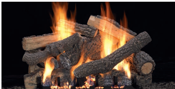
Ponderosa Refractory Log Set (LS-24P) with Vent-Free Slope Glaze Burner System (VFSR-24)