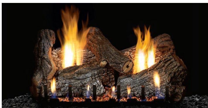
Sassafras Refractory Log Set (LS-24RS) with Vent-Free Slope Glaze Burner System (VFSR-24)