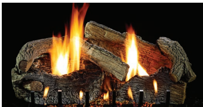
Stacked Aged Oak Refractory Log Set (LS-24SRAO) with Vent-Free Slope Glaze Burner System (VFSR-24)