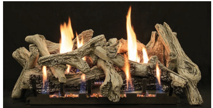
Driftwood Burncrete® Log Set (LS-24CD) with Vent-Free Slope Glaze Burner System (VFSR-24)