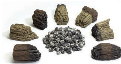
EK-2 Large Ember Kit available for Multi-sided log sets or large fireplaces.