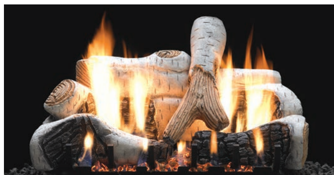
Birch Ceramic Fiber Log Set (LS-24B2) with Vent-Free Slope Glaze Burner System (VFSR-24)