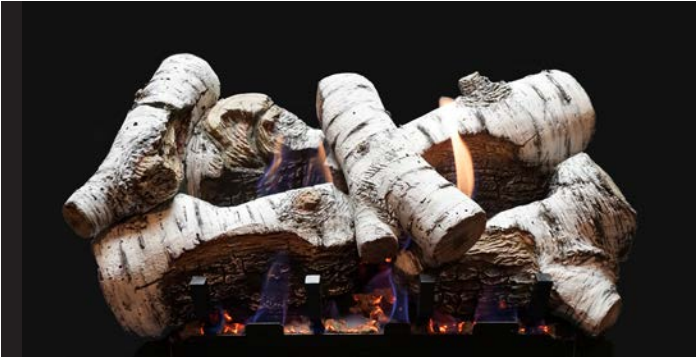
Birch Burncrete® Log Set (LS-18CB) with Vent-Free Slope Glaze Burner System (VFSR-18)