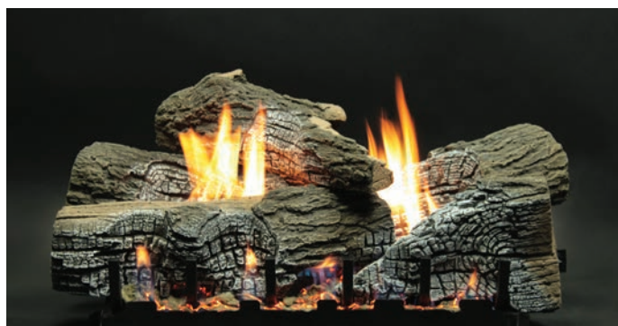
Stacked Wildwood Refractory Log Set (LS24WRR) with Vent-Free Slope Glaze Burner System (VFSR-24)